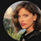
NOA TISHBY Israeli-American actress, producer, writer and activist